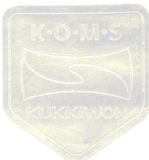
Kukkiwon Seoul South Korea

On behalf of the worldwide fraternity of Kukkiwon Black Belts and Oh Do Kwan we wish you the best of luck on your testing. Be assured that your test is being conducted in line with internationally recognized standards and overseen by an internationally recognized Taekwondo Academy and Internationally recognized Master Instructors.